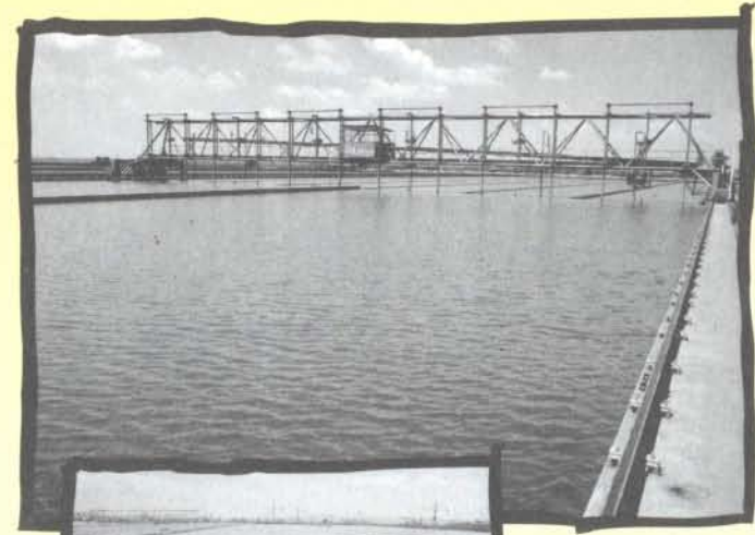
A SEDIMENTATION TANK WITH A DESLUDGING BRIDGE

The water flows slowly into large sedimentation tanks. The 'floc' then settles to the bottom of the tank to form 'sludge'. This is called sedimentation. The 'sludge' is sucked up by desludging bridges and sent to a sludge disposal site. The water in the top part of the tank is now cleaner. It flows over the side of the sedimentation tank into the carbonation tank.