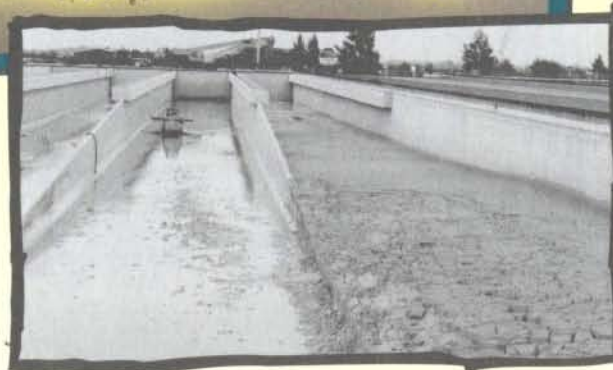
AN EMPTY SEDIMENTATION TANK