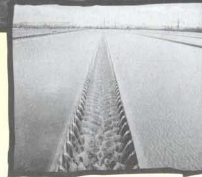
CLEAN WATER FLOWING OUT OF A SEDIMENTATION TANK