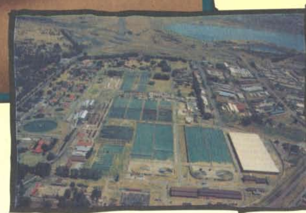
AN AERIAL VIEW OF A PURIFICATION STATION