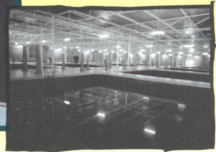
A FILTER HOUSE

The pH of the water has now been corrected through carbonation, but it still contains some small living organisms and germs. It flows into closed filter houses where it passes through sand filters. These are big, flat beds made up of different sized particles of sand and stone. As the water flows slowly through these filters all the small living organisms and some germs are trapped. The water now enters underground pipes.